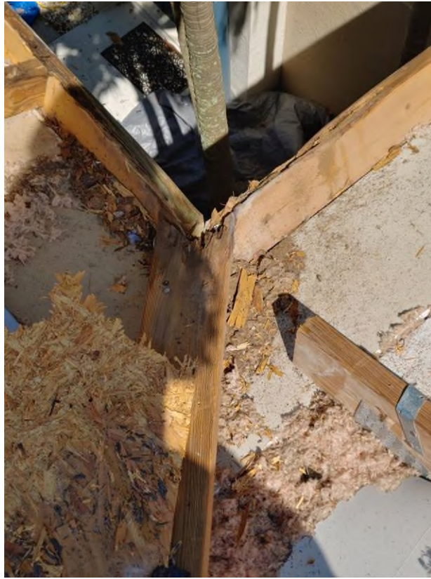
Photography #9: Rotten fascia and truss were observed on building 7880.