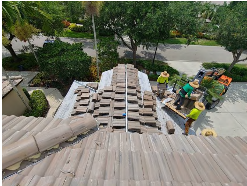
Photograph #9: Roof tiles were set in place for installation on building 21741.