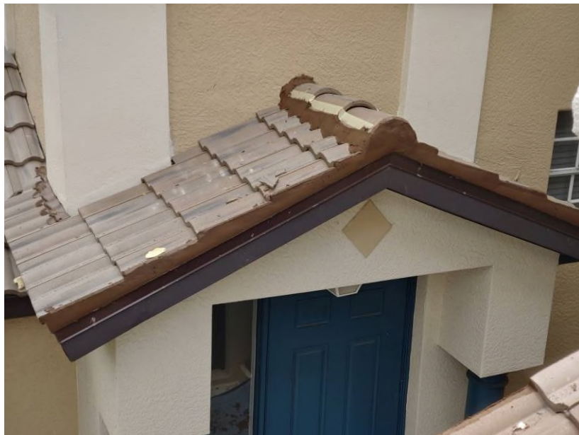
Photograph #2: Mortar adhesive application was in progress surrounding the ridge tiles and hip tiles on building 7840.