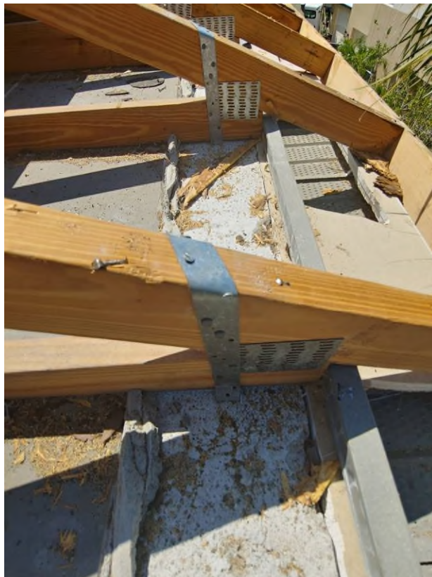
Photography #12: Existing strap clips on the trusses have the required minimum quantity of nails on building 21741.