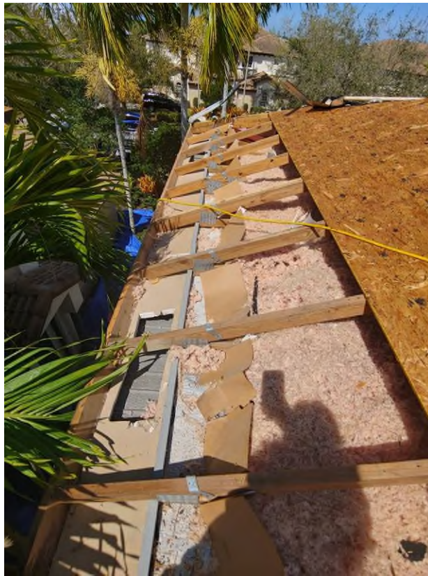
Photography #5: Existing strap clips on the trusses have the required minimum quantity of nails on building 7880.