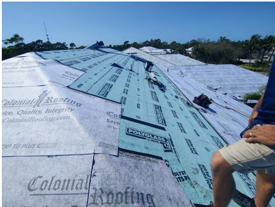
Photography #2: Polystick MTS Plus underlayment installation was completed and the second layer of underlayment installation was in progress on building 7870.