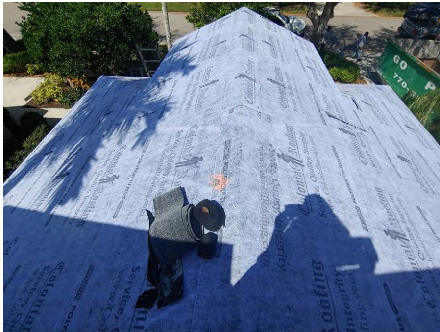
Photography #3: Second layer of underlayment installation was in progress on building 7870.