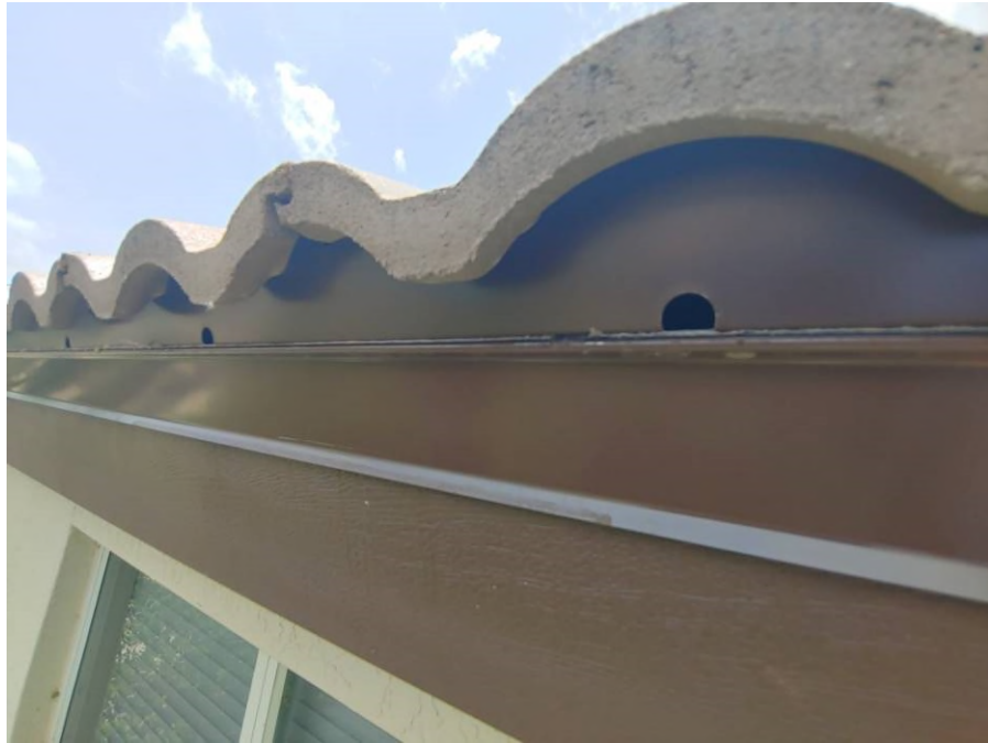
Photograph #7: Bird-stop metal flashing installation was in progress on building 21741.