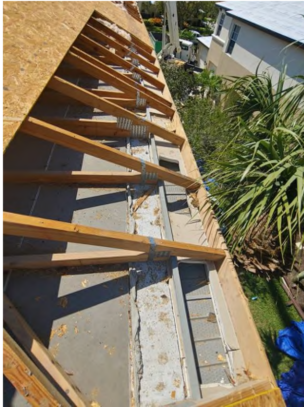
Photography #11: Existing strap clips on the trusses have the required minimum quantity of nails on building 21741.