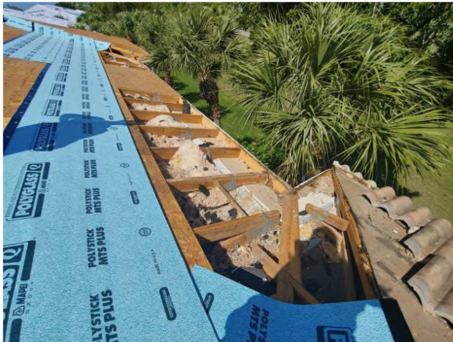
Photography #13: Polystick MTS Plus underlayment installation was in progress on building 21741.