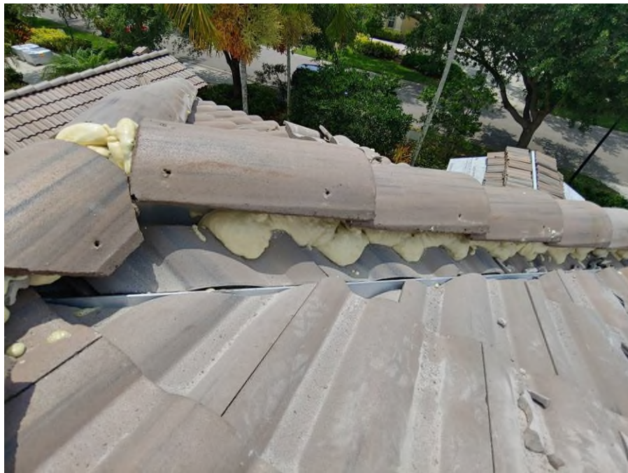
Photograph #6: Roof field, ridge and hip tile installations with polyurethane foam adhesive was in progress on building 21741.