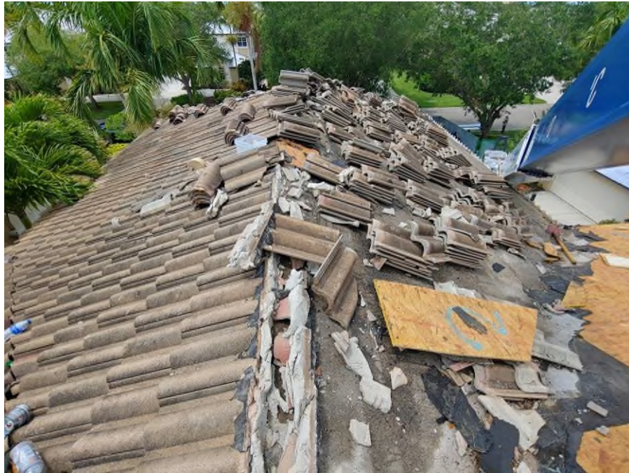
Photograph #13: Roof tile removal was in progress on building 21821.