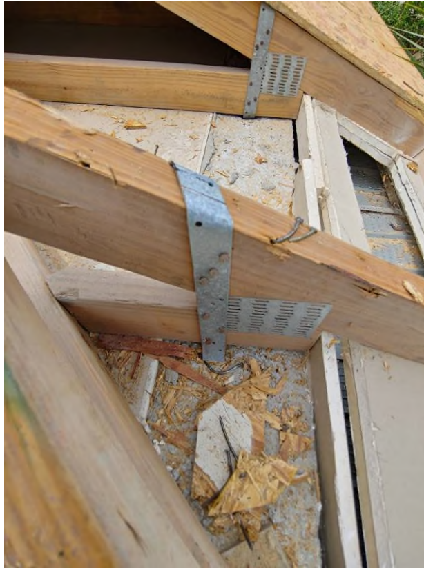
Photograph #15: Existing strap clips on the trusses have the required minimum of 5 nails on building 21821.