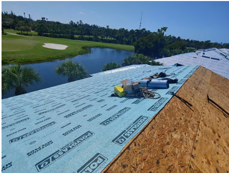
Photography #7: Polystick MTS Plus underlayment installation was in progress on building 7880.