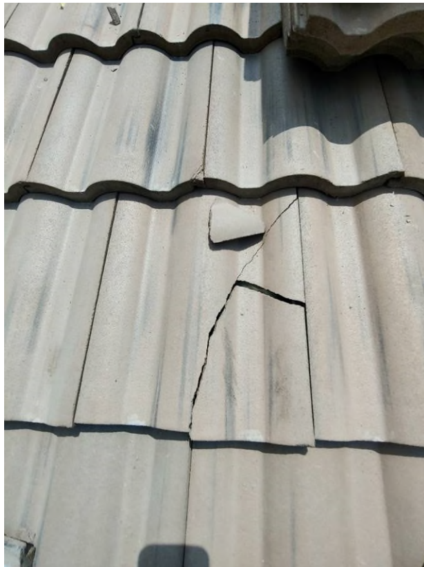
Photograph #8: Broken field tile replacement must be addressed on building 21741.