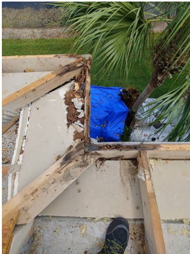
Photograph #16: Rotten fascia, trusses and plywood sheathing were observed on building 21821.