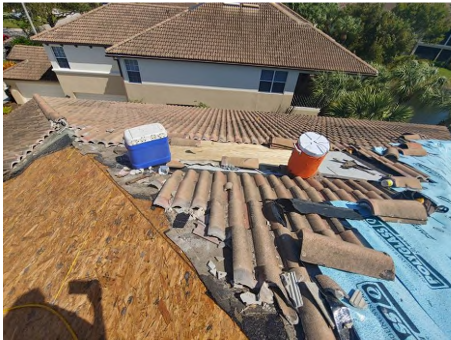
Photography #4: Roof tile removal was in progress on building 7880.