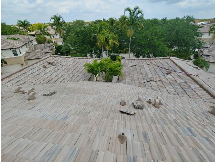
Photograph #3: Mortar adhesive application was in progress surrounding the pipes and exhaust vents on building 7840.