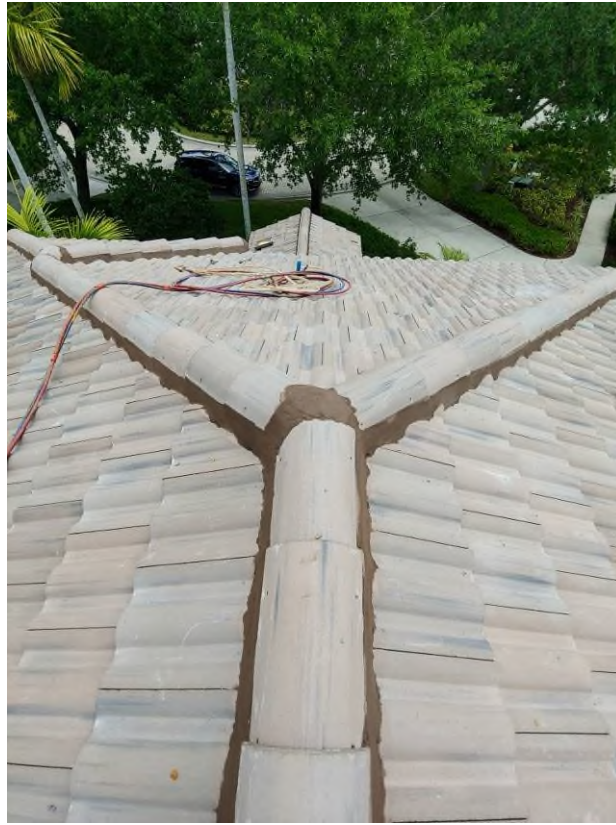
Photograph #1: Mortar adhesive application was in progress surrounding the ridge tiles and hip tiles on building 7840.