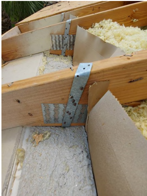
Photograph #14: Existing strap clips on the trusses have the required minimum of 5 nails on building 21821.