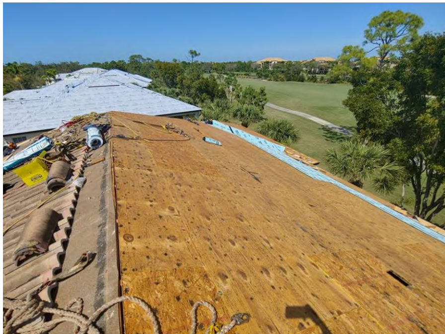
Photography #10: Roof tile removal was in progress on building 21741.