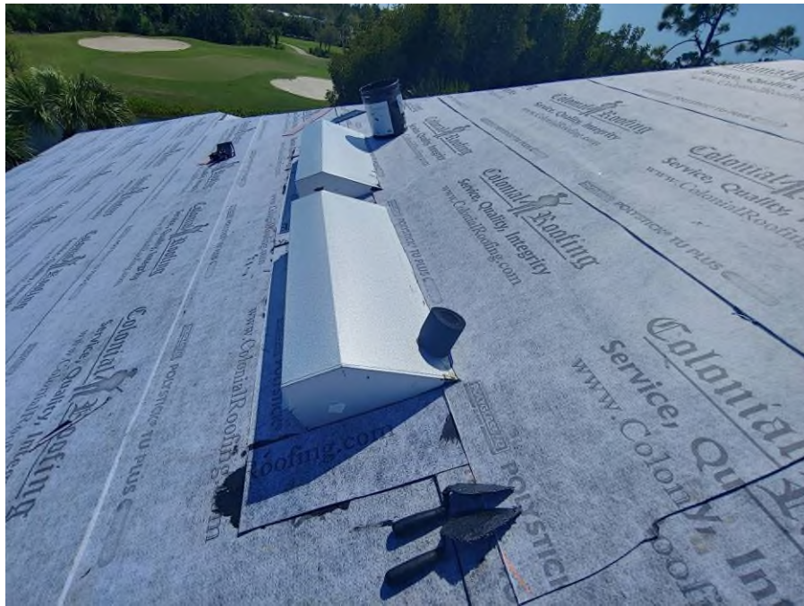
Photography #1: Exhaust vent installation was in progress on unit 7870.