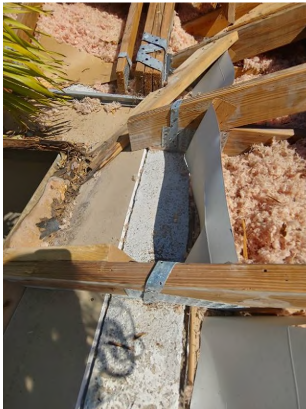
Photography #6: Existing strap clips on the trusses have the required minimum quantity of nails on building 7880.