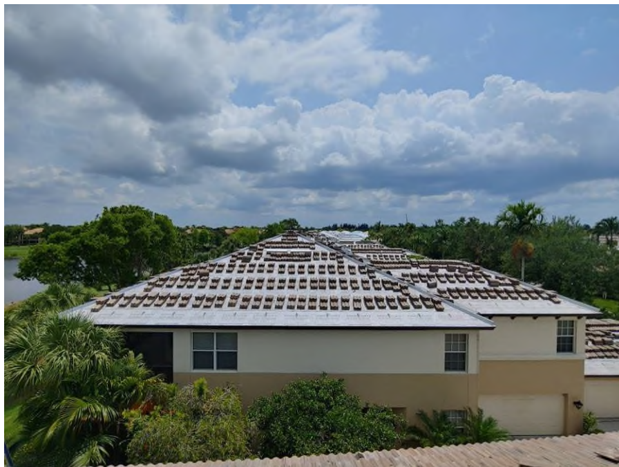
Photograph #10: Roof tiles were set in place for installation on building 21751.