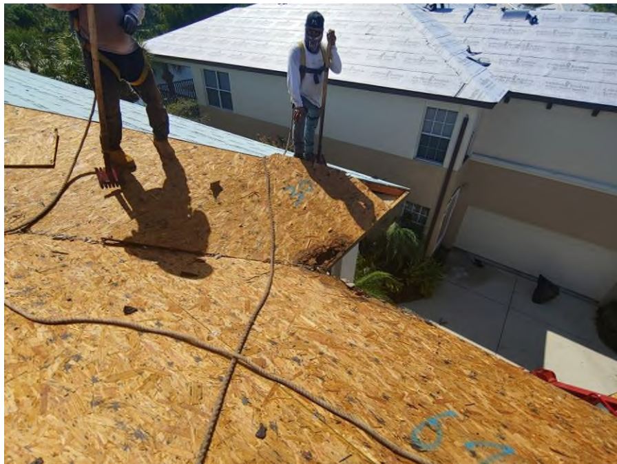
Photography #8: Rotten plywood sheathing was observed on building 7880.