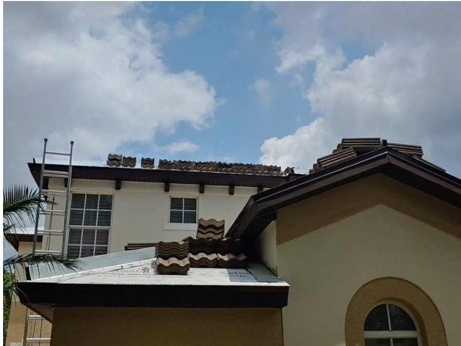
Photograph #11: Roof tiles were set in place for installation on building 21761.