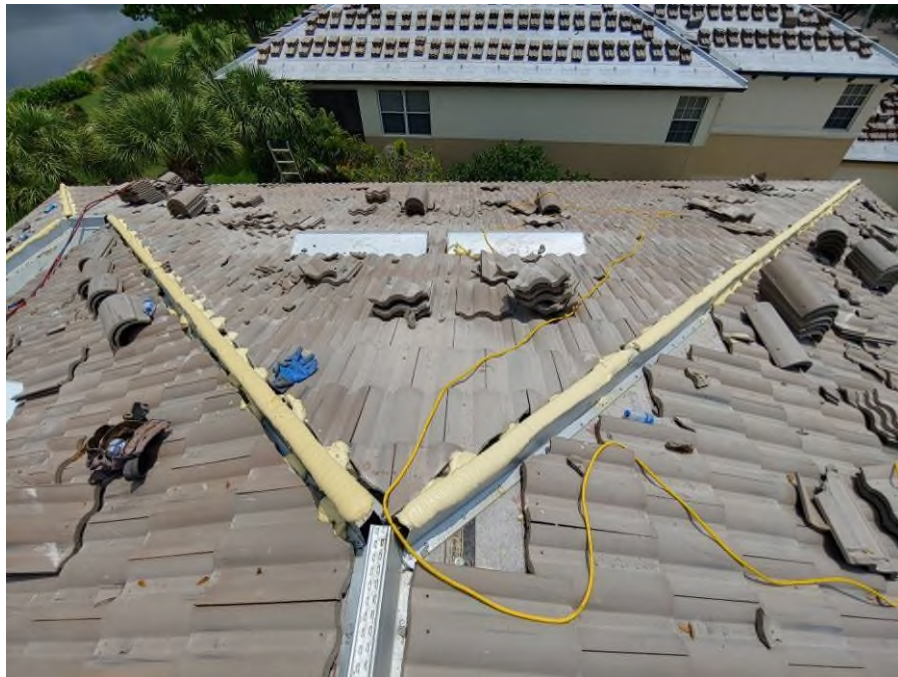
Photograph #5: Roof field, ridge and hip tile installations with polyurethane foam adhesive was in progress on building 21741.