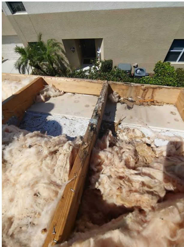
Photography #14: Rotten fascia and truss were observed on building 21741.