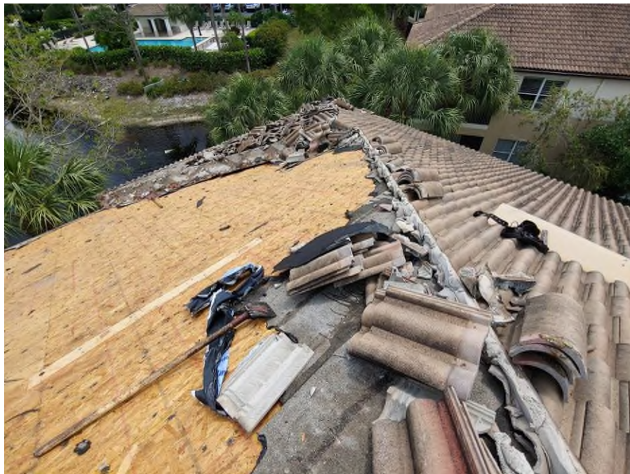
Photograph #12: Roof tile removal was in progress on building 21821.