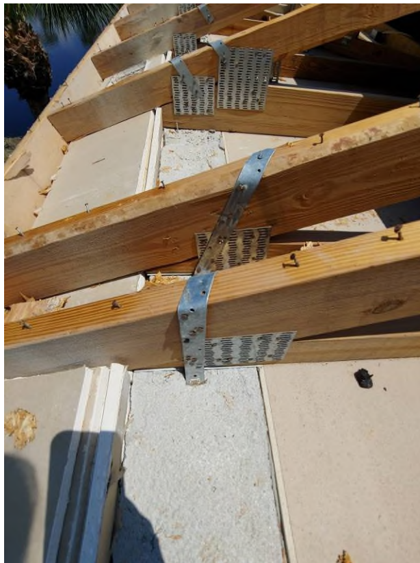
Photograph #14: Existing strap clips on the trusses have the required minimum of 5 nails on building 21811.