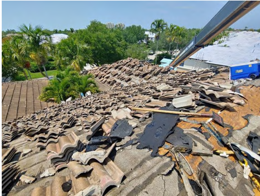
Photograph #11: Roof tile removal was in progress on building 21811.