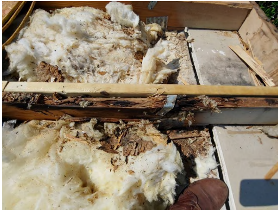
Photograph #15: Rotten fascia, trusses and plywood sheathing were observed on building 21811.