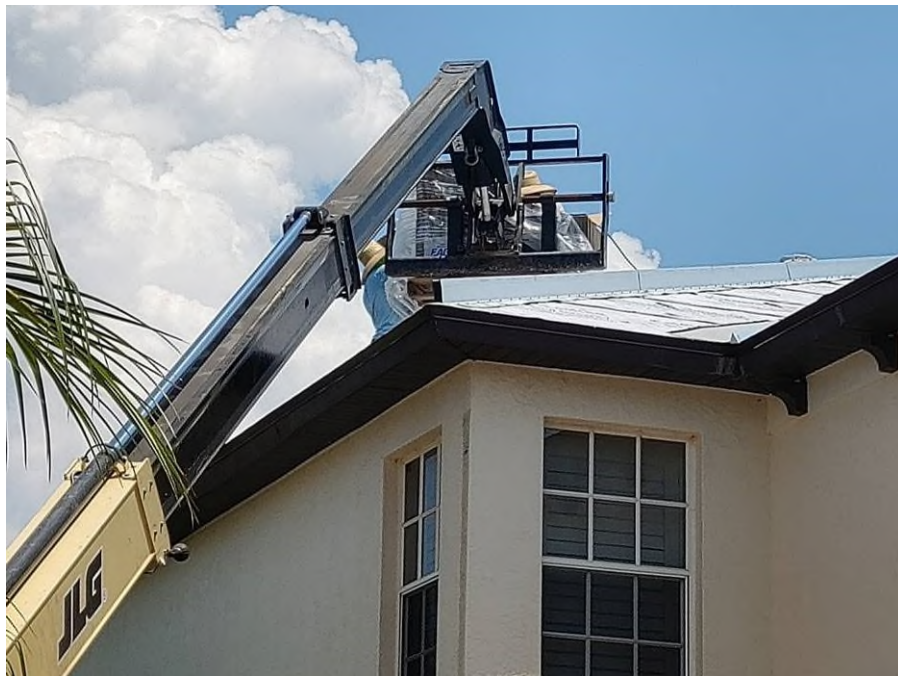
Photograph #6: Roof tiles were set in place for installation on buildings 21751.