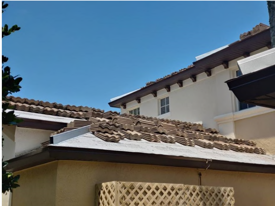
Photograph #5: Roof tiles were set in place for installation on buildings 21741.