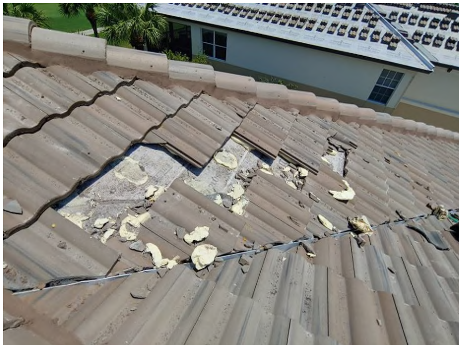
Photograph #4: Broken field tile replacement was in progress on building 21731.