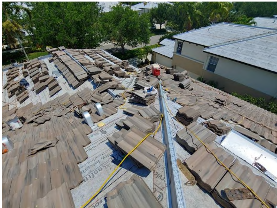
Photograph #8: Roof field tiles with polyurethane foam adhesive were in progress on building 21760.