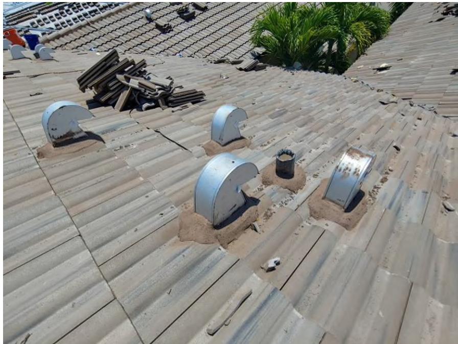
Photograph #2: Mortar adhesive application was in progress on building 21731.