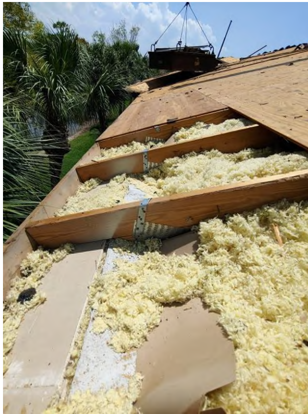
Photograph #13: Existing strap clips on the trusses have the required minimum of 5 nails on building 21811.