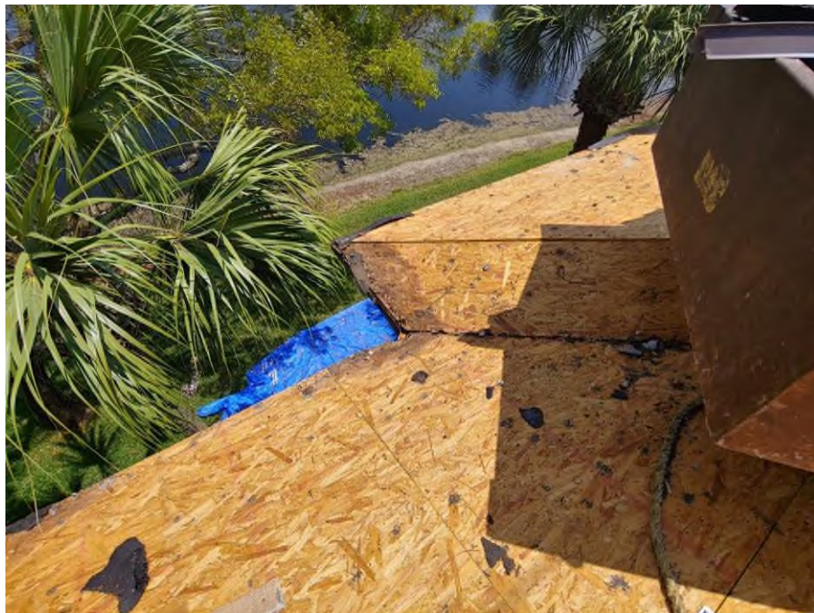
Photograph #16: Rotten fascia, trusses and plywood sheathing were observed on building 21811.