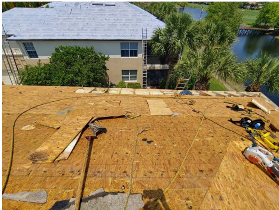
Photograph #12: Roof tile removal was in progress on building 21811.