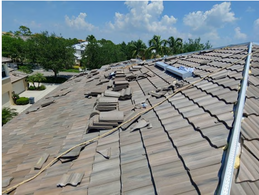
Photograph #7: Roof field tiles with polyurethane foam adhesive were in progress on building 21760.