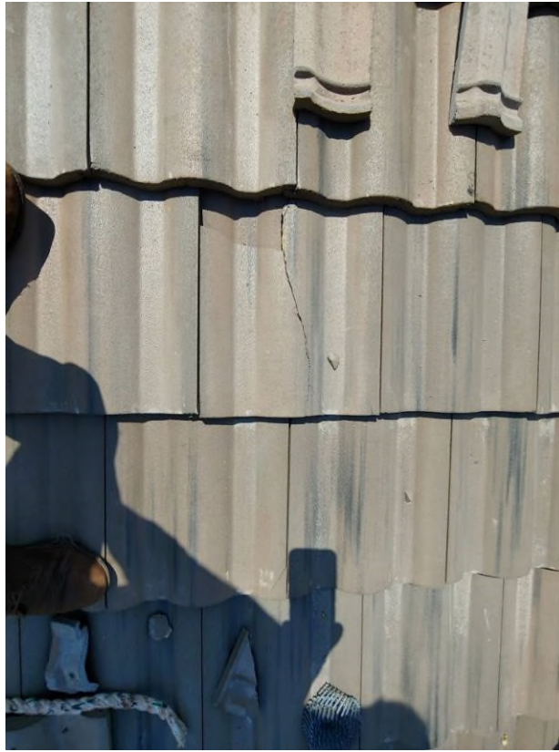
Photograph #9: Broken field tile replacement must be addressed on building 21760.