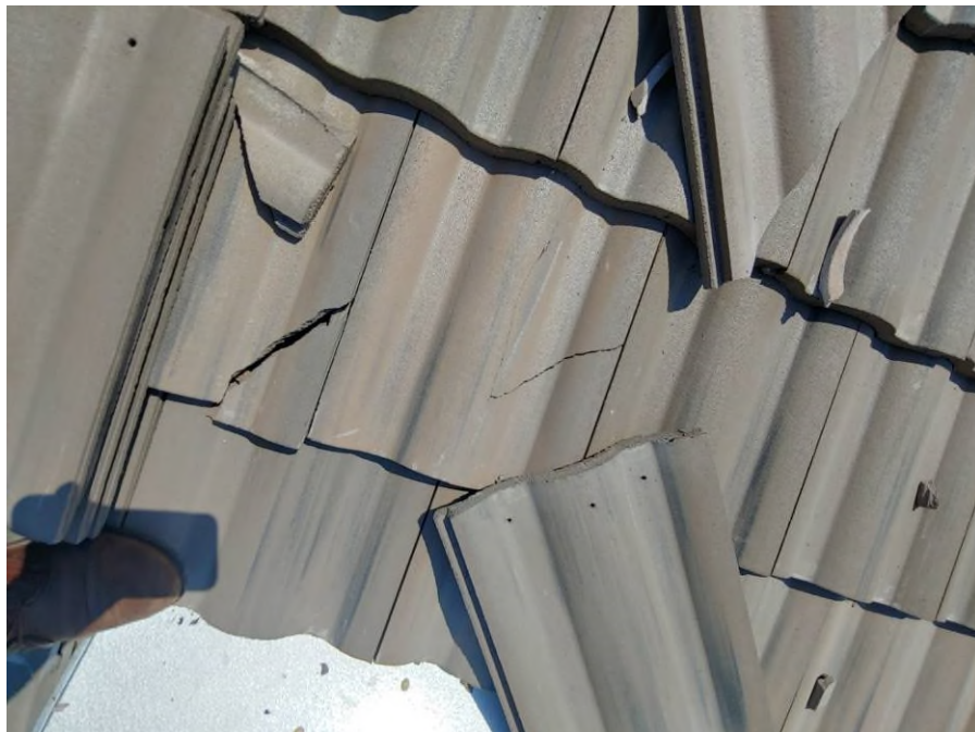
Photograph #10: Broken field tile replacement must be addressed on building 21760.