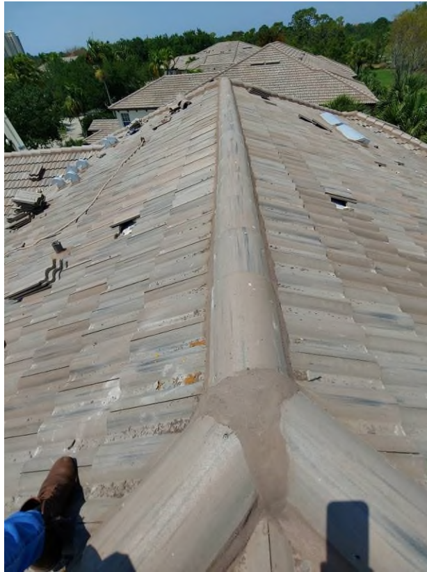
Photograph #1: Mortar adhesive application was in progress on building 21731.