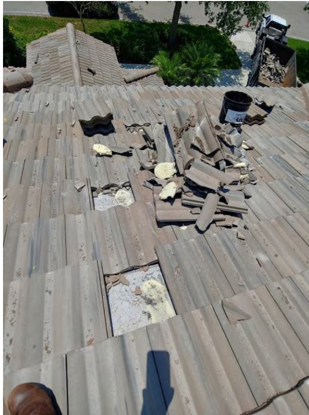
Photograph #3: Broken field tile replacement was in progress on building 21731.